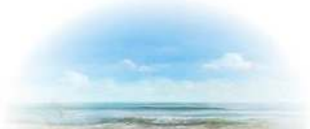
A cool day at the beach!